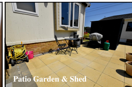
Patio Garden & Shed